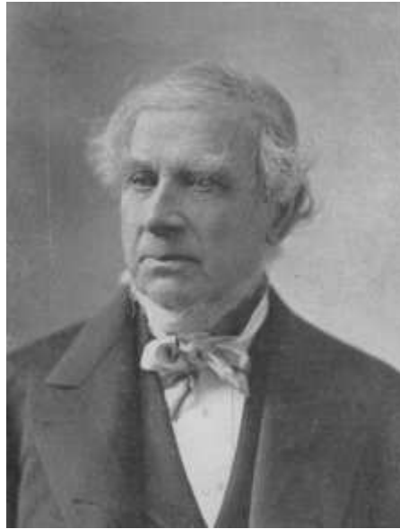
THURLOW WEED, American Journalist and Politician. b. Cairo, N.Y., 1797; d. New York, 1882.

Say what we will of genius, specialized in a hundred callings, yet the fact remains that no amount of genius has ever availed upon the earth unless enforced by will power to overcome the obstacles that hedge about every one who would rise above the circumstances in which he was born, or become greater than his calling. Was not Virgil the son of a porter, Horace of a shopkeeper, Demosthenes of a cutler, Milton of a money scrivener, Shakespeare of a wool stapler, and Cromwell of a brewer?