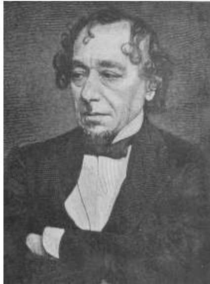
BENJAMIN DISRAELI (Earl of Beaconsfield), English Statesman and Novelist. b. London, 1804; d. London, 1881.

"Every condition, be it what it may," says Channing, "has hardships, hazards, pains. We try to escape them; we pine for a sheltered lot, for a smooth path, for cheering friends, and unbroken success. But Providence ordains storms, disasters, hostilities, sufferings; and the great question whether we shall live to any purpose or not, whether we shall grow strong in mind and heart, or be weak and pitiable, depends on nothing so much as on our use of the adverse circumstances. Outward evils are designed to school our passions, and to rouse our faculties and virtues into intenser action. Sometimes they seem to create new powers. Difficulty is the element, and resistance the true work of man. Self-culture never goes on so fast as when embarrassed circumstances, the opposition of men or the elements, unexpected changes of the times, or other forms of suffering, instead of disheartening, throw us on our inward resources, turn us for strength to God, clear up to us the great purpose of life, and inspire calm resolution. No greatness or goodness is worth much, unless tried in these fires."