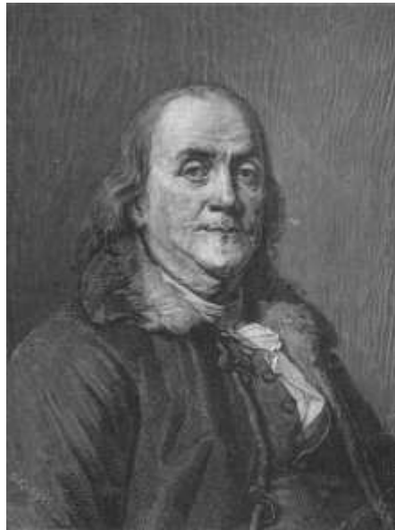
BENJAMIN FRANKLIN, American Philosopher, Statesman, Diplomatist, and Author. b. Boston, 1706; d. Philadelphia, 1790.